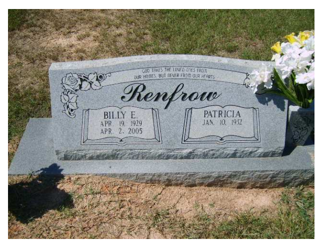
Billy Edward Renfrow Perryville Cemetery Perryville, Wood Co., TX