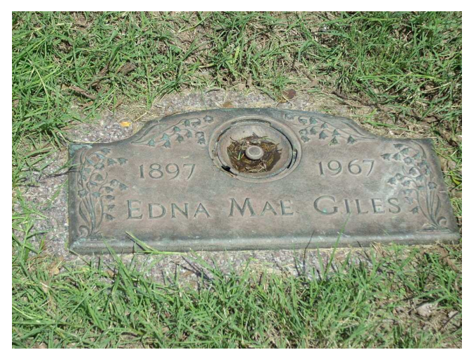
Edna Mae Blair Renfrow Peavler Giles Highland Gardens, Lot 37, Block D, Space 6 Restland Memorial Park Dallas, TX